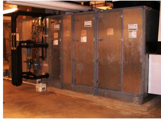
Central Station AHU