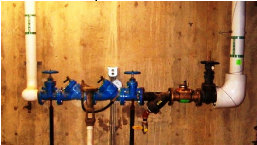
Water Service Entrance